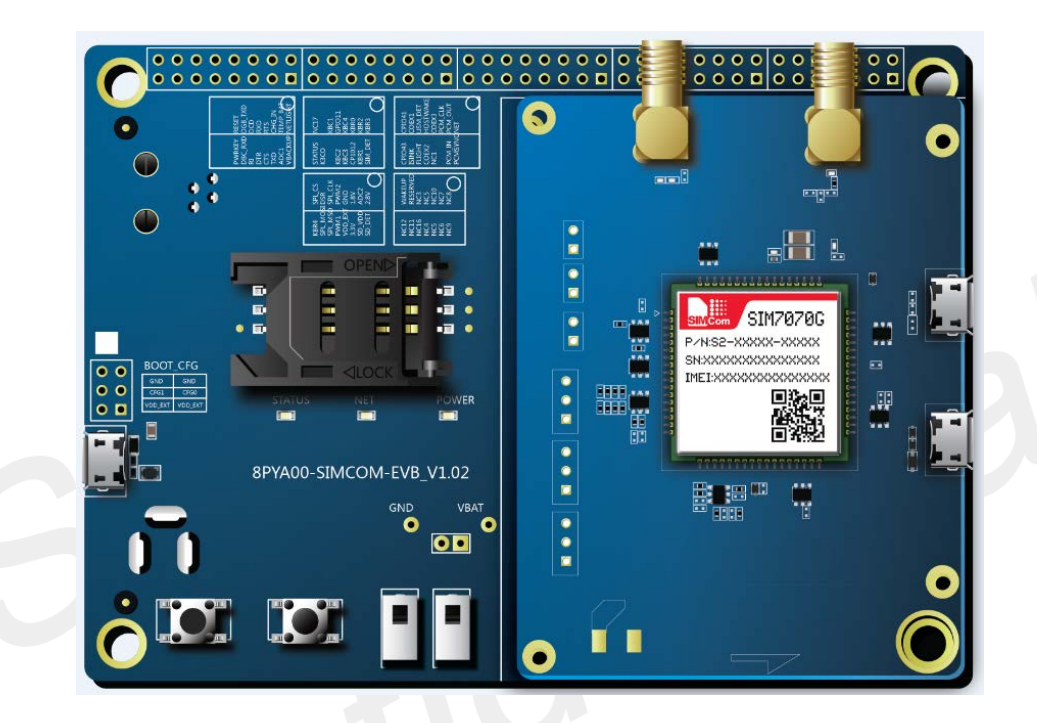
Figure 3: TE and SIMCOM-EVB Accessory

TE Kits are compatible with EVB Boards and they fitted like on the following figure.