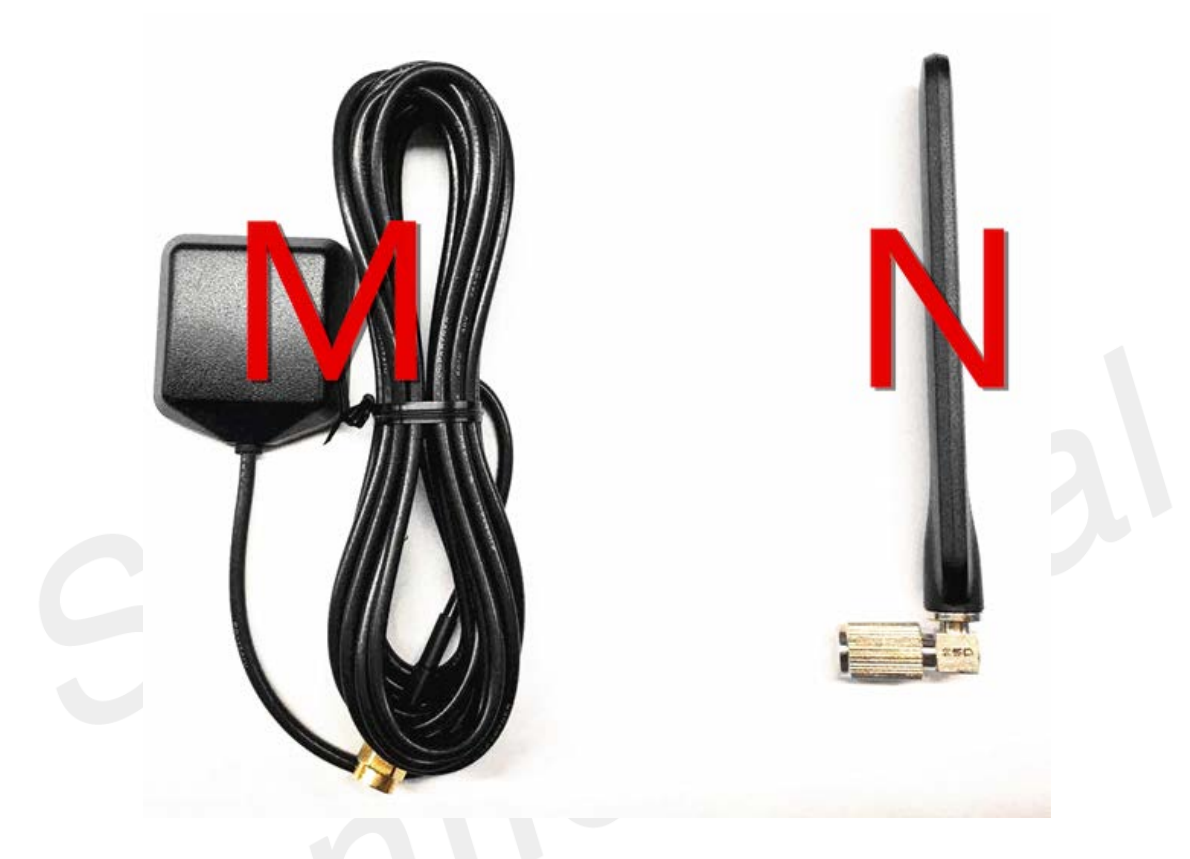
Figure 2: TE Accessory