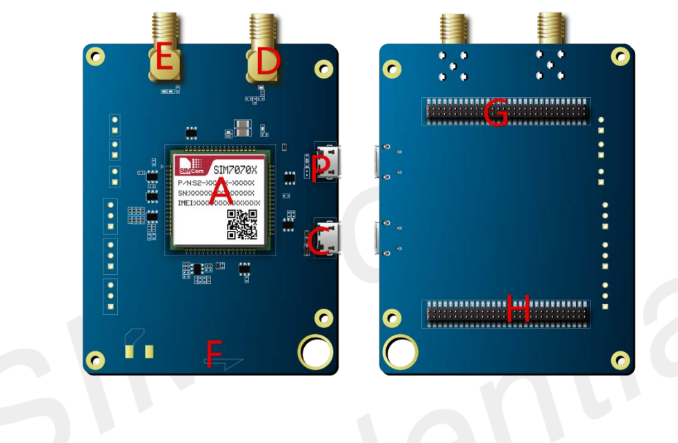
Figure1: TE View